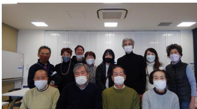
(Volunteers for Food Bank activity at the end of the year)